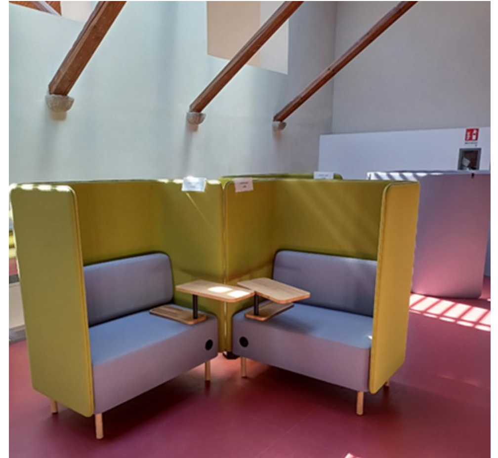
smart area with sofa/work station (by reservation)